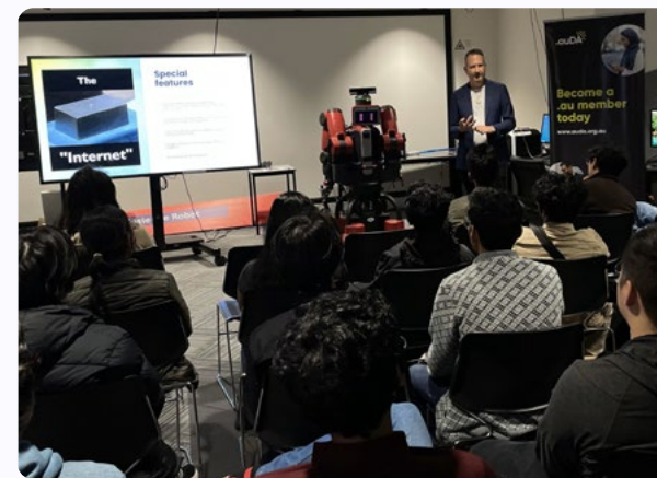
.au member event with RMIT University students